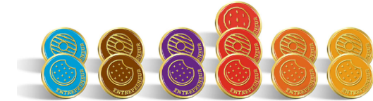
Girl Scout Cookie Program Pin Collection